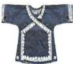
Clothes edge decorative pattern