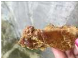
The solidification Of Liquidambar oil