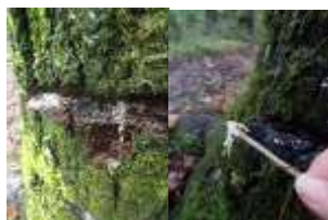
Take Liquidambar resin