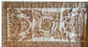
Product display (semi-manufactured goods)