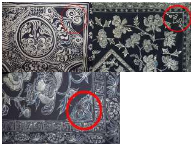
Quilt cover corner decorative pattern & Sheet corner decorative pattern