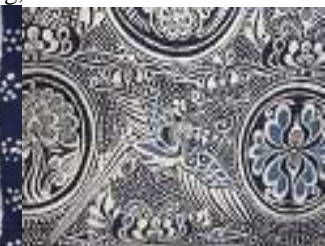
Set spot to surface