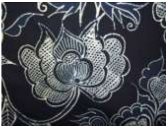
Two seal wax fished product