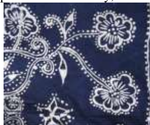
Set spot into line

Often used to point in Liquidambar dyed pattern design, in addition to its possible cultural significance, also has a very important role in design decorative effect. The application of different sizes of dots set spot into line, set the spot into the surface, carefully arranged various "floral" decorative screen, auxiliary decoration formed foil the main figure, make the pattern more closely, shading, richer.