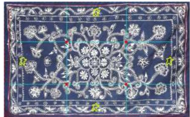
Pattern layout-- "井" words