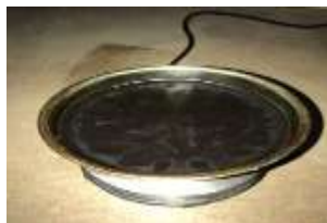
post mixing heating